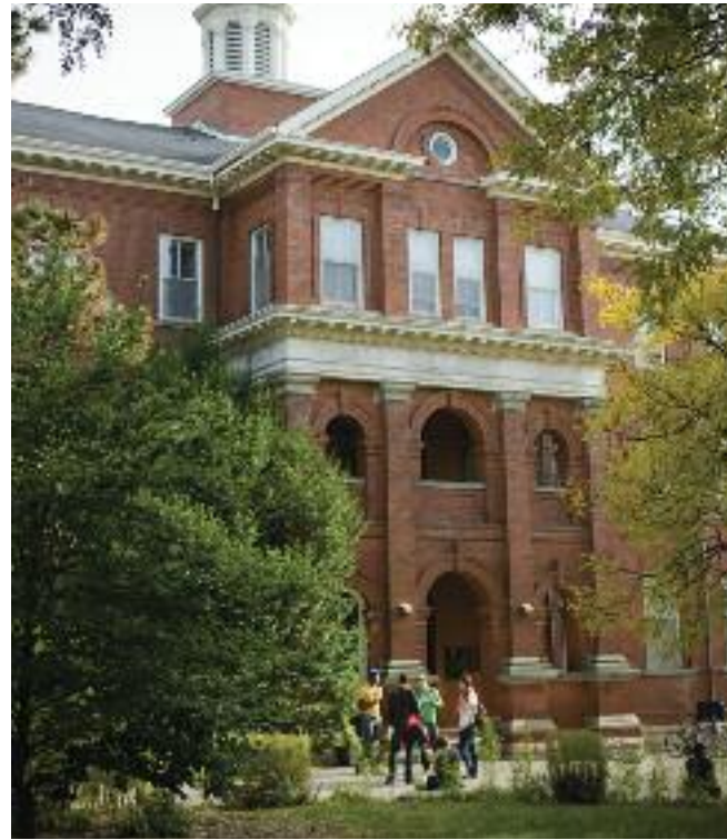
The J.D. MacLachlan Building , named for the first President of the University of Guelph, is currently home to the School of Business and the Department of Food, Agricultural and Resource Economics .