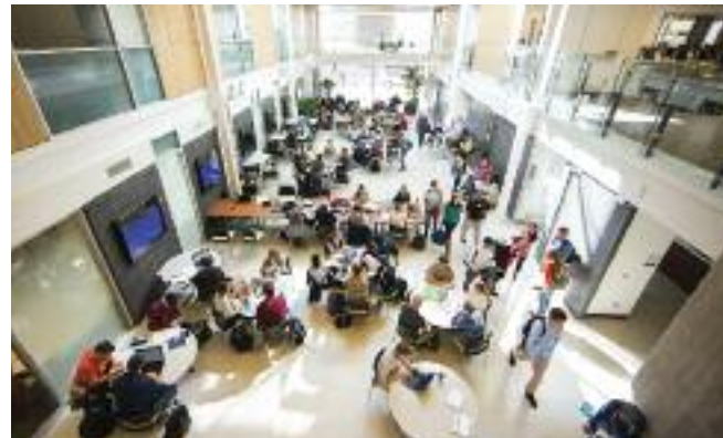
The University of Guelph's new Engineering Complex, made up of 52,000 square feet of space in the Thornbrough and Richards buildings, accommodates classrooms, laboratories, study areas and design studios. The new facilities encourage collaborative learning, as students from varied disciplines work together on solutions to real-world problems.

“I was attracted to the warm and helpful environment at U of G, but it was the exciting classes, experiences and friendships that made me fall in love with this university. It was easy to get involved on campus, enriching my experience here beyond what I could have expected.”